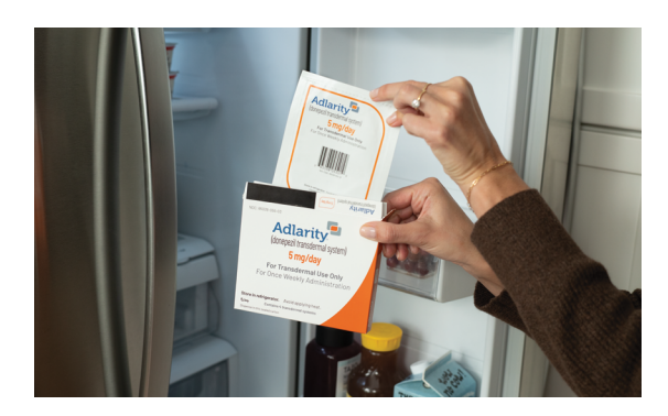
ADLARITY must be kept in the refrigerator. When you're ready to apply it, take out 1 pouch.