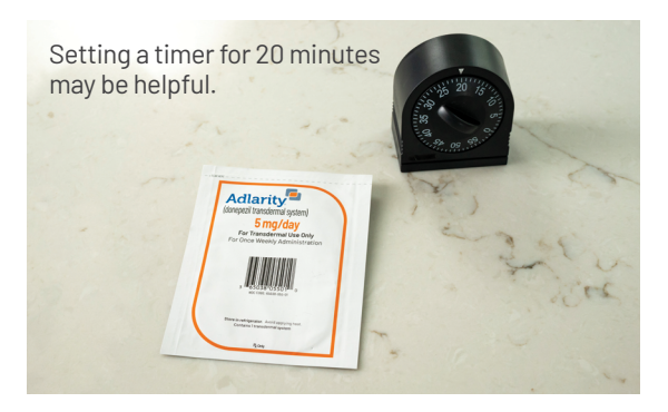
Before applying ADLARITY to the skin, allow it to reach room temperature.